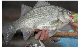
THE WHITE BASS RUN: A Texas Springtime Fishing Spectacle