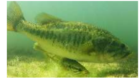
THE LARGEMOUTH BASS SPAWN: A Prime Time for Anglers